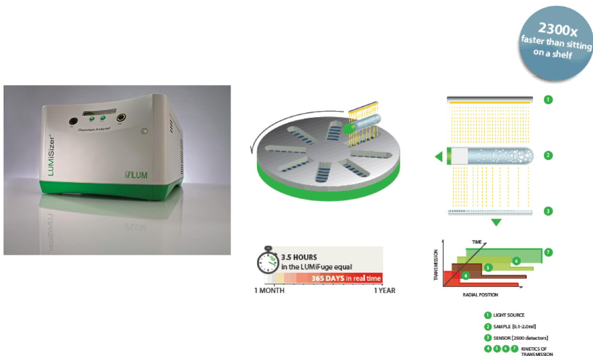
Figure 1. LUMiSizer® and STEP-Technology® from LUM GmbH.

Liquid phase direct chemical exfoliation is a promising research direction in the field of graphene production aiming direct conversion of large volumes of raw graphite powder into the final graphene product with nearly pristine crystal structure and physical properties unlike any other graphene synthesis techniques. Usually organic solvents like N-Methylpyrrolidone (NMP) are employed as exfoliation media in this field however Grafen Co. chooses aqueous surfactant solutions specifically targeting to avoid toxicity of those organic solvents.